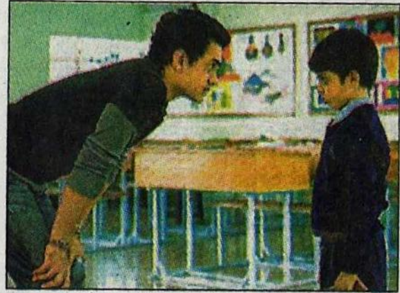
'তারে জমিন পর' ছবির একটি দৃশ্য।

এ বছরই দিল্লির বিশ্ব শিক্ষা সম্মেলনে আনুষ্ঠানিক ঘোষণা হয়েছে ডিএসটি-র সূচনার। সাম্প্রতিক সমীক্ষায়