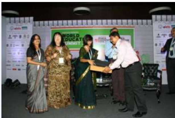
The better to know you: At the launch of the Dyslexia Screening Test - Junior toolkit.